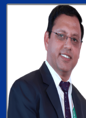
Dr. Rajeev Pachauri